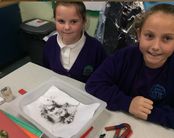
Pencoys Photo Album